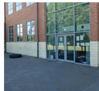
MAIN PLAYGROUND DOORS

If you are late, you should use the blue front doors.