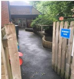
NEW NURSERY GATE