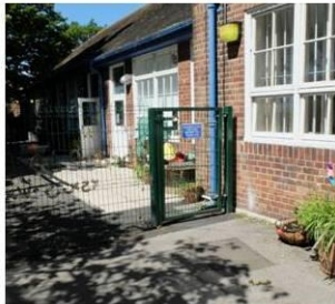
EARLY YEARS GARDEN GATE