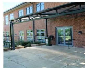
MAIN SIDE DOOR